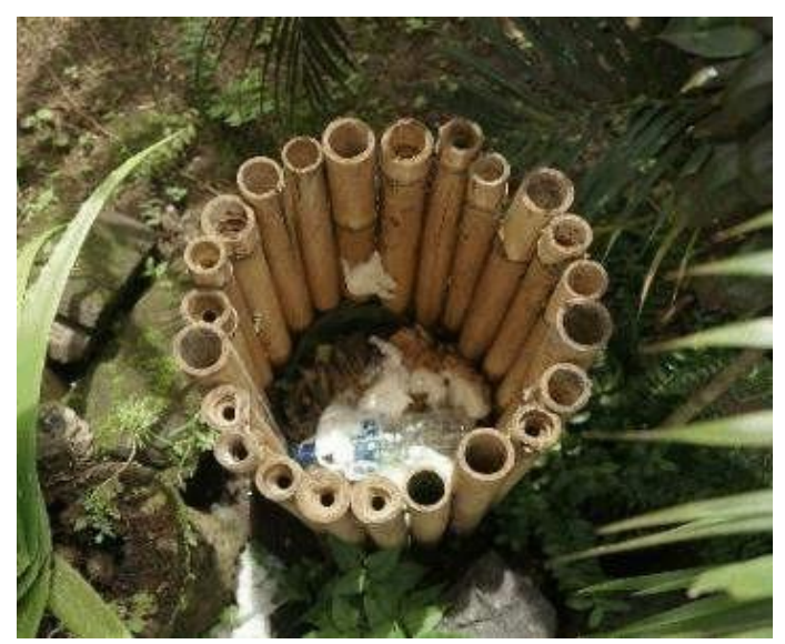
Figure 4. Eco-friendly equipment at Amarta Trash can