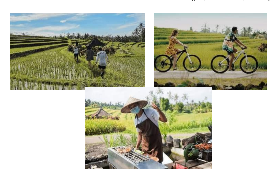
Figure 5. Tourist Attractions Tracking (top left) to Pematang Sawah, Cycling (top right), and Cooking Class (bottom)