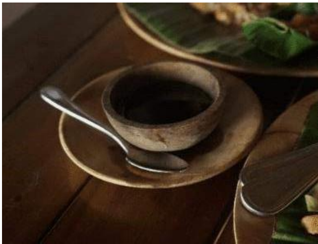
Figure. 3 Eco-friendly equipment at Amarta soy sauce bowl