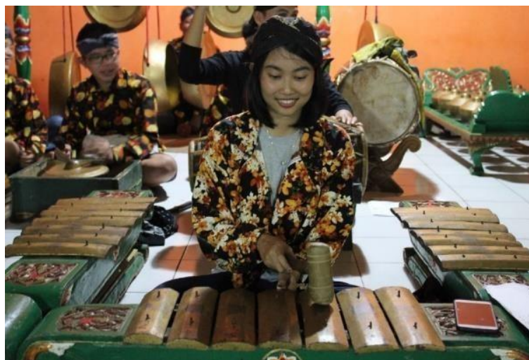
Figure 8. Learn art with methodsStudy play tool music gamelan