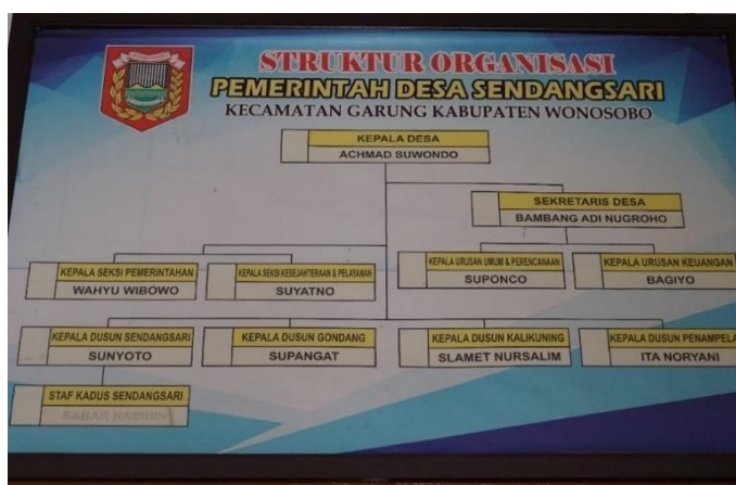
Figure 1. Structure Government Organization Village Sendangsari