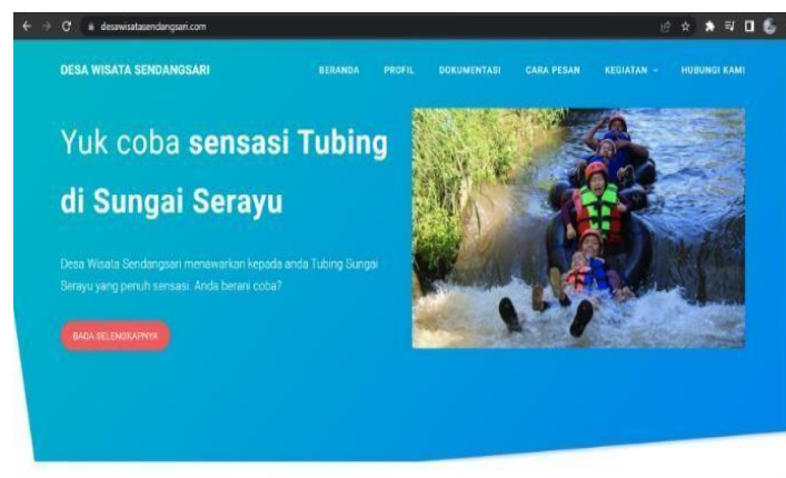
Figure 2 Sendangsari Tourism Village social media

In the promotion of the Sendangsari Tourism Village, the community uses two promotion methods, namely offline And on line Which Where promotion with method offline that is with spread brochure package tour to several schools and agencies, then introduced the Sendangsari Tourism Village to Pokdarwis Village Other, And introduce Village Tour Sendangsari in a number of program like exhibition – exhibition, workshops, etc Which usually attended Also by public general and for promotion with use online method that is with media social like website, Instagram and facebook.