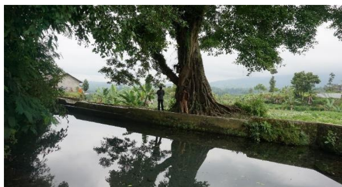
Figure 9. Gondang River (source eye water)