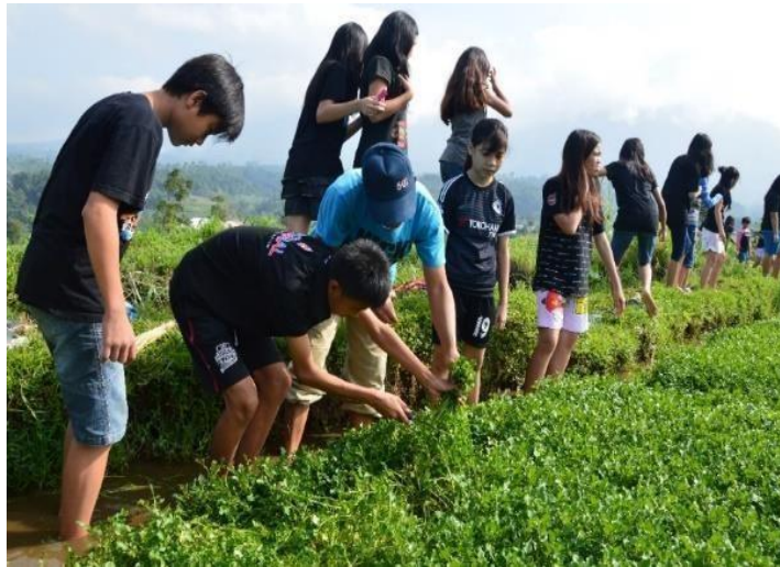
Figure 7. Agrotourism (study plant, take care to harvest plant lettuce water)