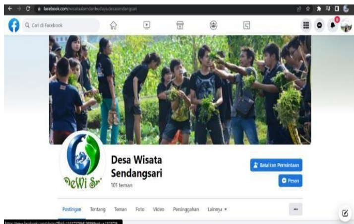
Figure 4. Sendangsari Tourism Village Facebook

In developing a Tourism Village the community cannot move on their own because it is in the process community tourism village pioneers do not yet have sufficient capital. Hence society work with the local government to assist in permitting tourism activities, then help complete the facilities and support tourism activities in Sendangsari Village as well as funding infrastructure needed to help develop tourism potential in the village Sendangsari.