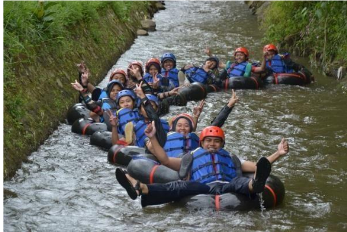
Figure 5. The tourism potential of Sendangsari Village River Tubing