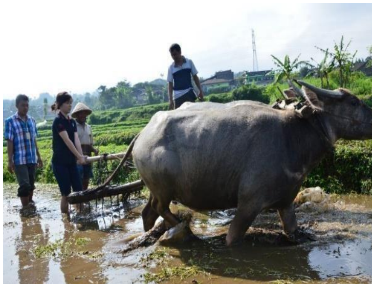
Figure 6. Live-in (follow activities owner House with plowing ricefield)