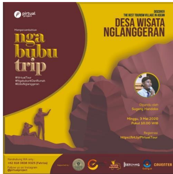
Figure 1. Virtual tour activity poster for Nglanggeran Tourism Village

Virtual tours to destinations will be guided by tour guides who carry out tasks like traveling directly. The tour guide will explain one by one the routes that will be passed; then, the green screen will lead to the ways mentioned by the tour guide at that time. After explaining the street, the tour guide will immediately take you to the first destination according to the goal the tourist has chosen. This activity will be repeated until the last tourist destination.