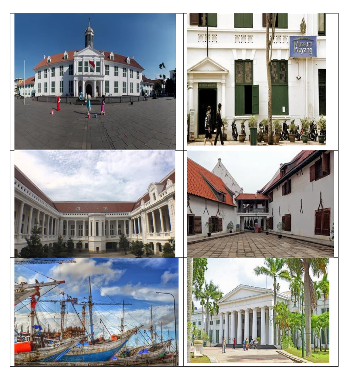
Figure 1. Some of tourist products at Kota Tua Jakarta: Museum Fatahillah, Museum Wayang, Museum Bank Indonesia, Museum Bahari, Museum Sunda Kelapa, Museum Keramik