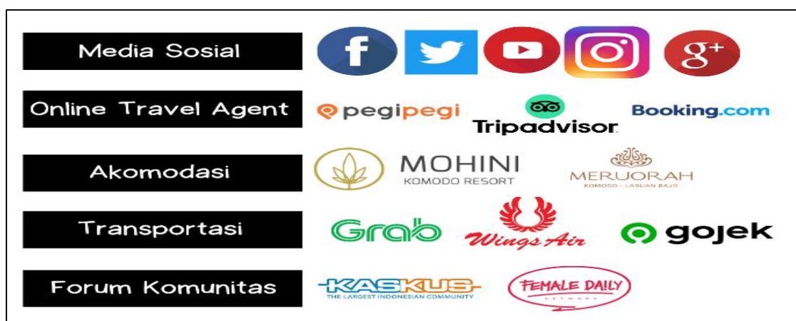
Figure 1. Platform Digital

Various platforms can be used as a means of digital-based marketing (et al., 2020). In Figure 1, several tourism ecosystems are presented, all of which can be accessed online.